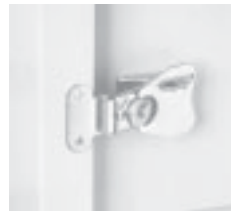
Twist Latch Detail