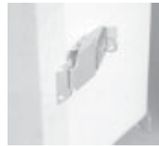
Snap Latch Detail